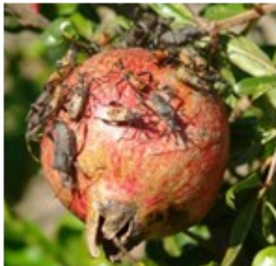
Leaf-footed bugs attacking fruit.

The most serious problem with pomegranate is the occurrence of a fungal disease which affects both the leaves and the fruit, causing premature leaf loss and also resulting in fruit splitting on the plant. While the leaf drop may be tolerated, fruit splitting cannot, since the splitting usually occurs just as the fruit begins to mature. Copper fungicide use during fruit development of late spring through summer may alleviate the problem, but control of the disease is presently not fully understood.