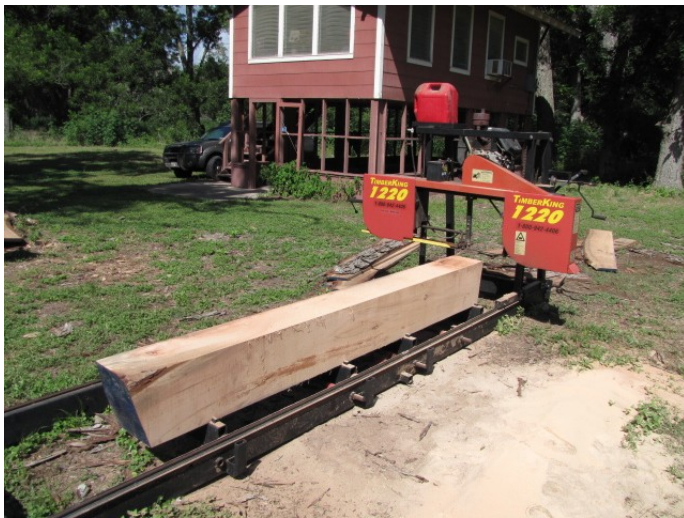
Small saw mills can be used to mill pecan lumber.

The best timber sales have come from individuals who have small portable sawmills. They have been able to cut and dry their timber for their own use or for retail sale. Such mills do a good job, but it requires a lot of work. Pecan logs have been sold for mushroom production and firewood. In addition, firewood has probably accounted for most of the sales, although the market can become saturated.