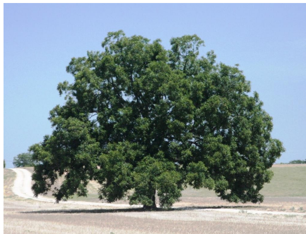
Deep alluvial soil; characteristic of native pecan bottoms

All native pecan groves are different. Those growing along large rivers or streams have more economic potential because of deep soils, at least 20 feet, and subsurface irrigation as opposed to those on small creeks. Large trees have more economic potential up to a certain point. There comes a time when some trees get too big to spray and harvest. Areas should be checked for potential floods as flooding during the fall harvest can destroy the entire crop. A few isolated native trees are not good as wildlife predation can typically get the whole crop.