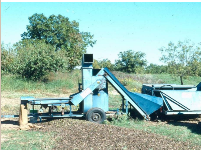
Pecan blower or vacuum separator

shading and must be picked up and stacked prior to the harvester picking up the nuts. Once harvested, the nuts will need to be run through some type of blower or vacuum separator to remove the remaining sticks, pops and other foreign material before placing in sacks. Most natives are stored and transported to market in a type of “super sack” to reduce the labor needed to handle and move the nuts. A sample should be pulled from each sack in order to determine how well the nuts grade out. Average shell out (percent kernel) values for native pecans is commonly 41 to 42 % kernel.