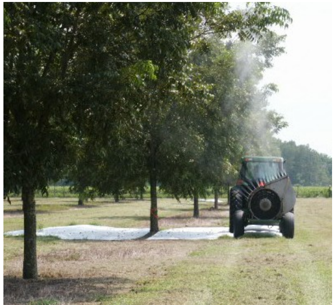
Air-blast type pecan tree sprayer

the spring, and it is unusual, although not unthinkable for the flower crop to be damaged by