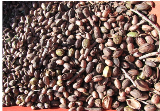
Machine-harvested pecans and trash before processing