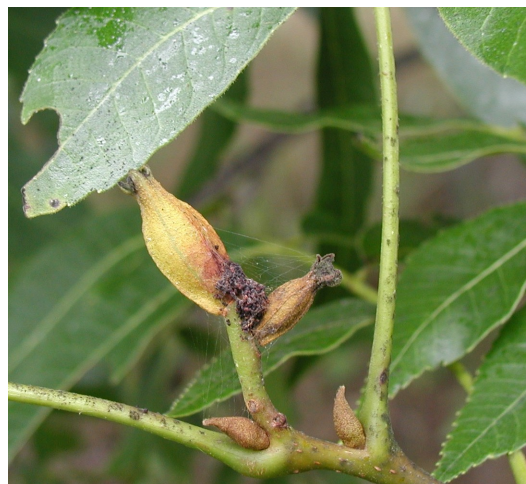
Damage from pecan nut casebearer larvae

todes, Cotton Root Rot, and Crown Gall are potential problems in some regions of Texas.