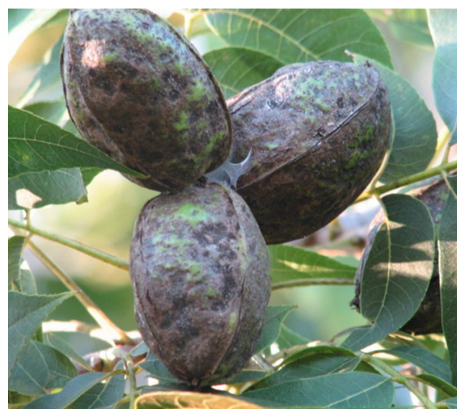
Pecan scab on pecan shuck

prevalent. All growers may encounter Downy Spot, Powdery Mildew, Shuck Dieback, Stem-End Blight, Bacterial Leaf Scorch, among others. Root-knot nema-