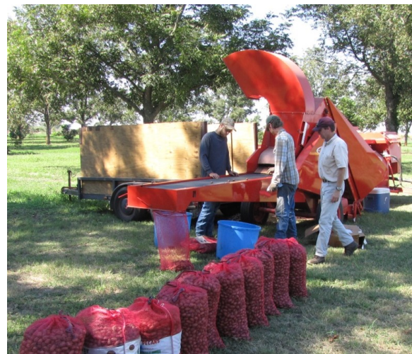
Pecan cleaner and sacking operation