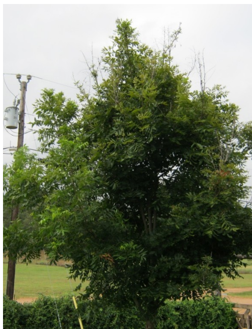
Pecan tree exhibiting severe zinc deficiency ; bunched canopy , small leaves , & limb dieback

Foliar Zinc Sprays are essential for pecan growth in Texas. Soil or drip system applications of zinc are not effective. Zinc is needed for leaf expansion, so applications should be made frequently in the early portion of the growing season for maximum growth. Two products, zinc sulfate wettable powder or liquid zinc nitrate, are used with equal success. Liquid nitrogen (32% urea ammonium nitrate) can be added to either zinc