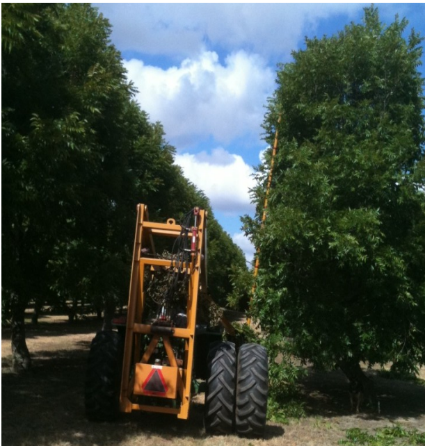
Mature, 30x30 spaced orchard hedged annually to maintain sunlight.

Future tree removal operations should be considered in the designed layout of main varieties, temporary varieties (if any) and pollenizers. Pollenizers should be located so that they will be present in the orchard after trees are strategically removed.