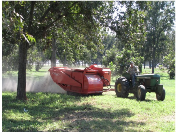
PTO—powered pecan harvester

to prevent kernel darkening, embryo rot, vivipary (sprouting), mycotoxins such as aflatoxin, and other problems related to moist pecans. Shucks not removed in the orchard by nature or the harvesting equipment are removed with dehulling equipment. In south Texas, where harvest is begun before the shucks are fully open to prevent vivipary, the shucks must be ground off in water with special equipment. Once de-shucked, poorly filled pecans are vacuum sepa-