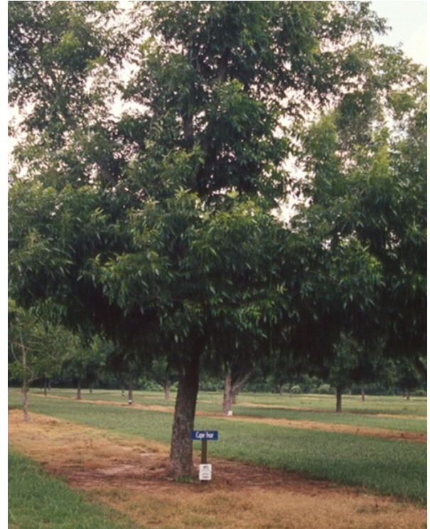
“Sod and Strip” orchard floor

Weeds must be controlled in young and mature pecan orchards to prevent reduced growth