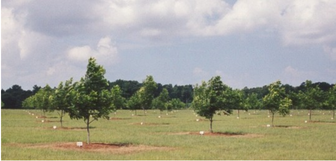
Well spaced young pecan orchard

ing that occurs. Wider spacing (50 x 50; 60 x 60) is recommended for growers who want to extend the time when crowding prevention methods will be needed. Where there is a desire for pecan trees to never crowd, they should be planted 75 to 100 feet apart or further.